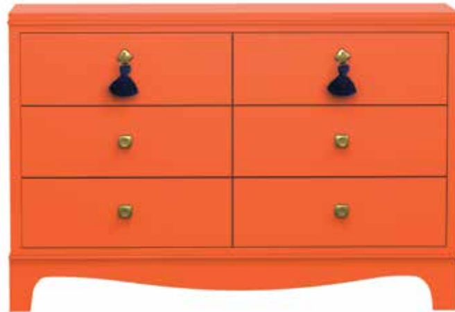
5 OOMPH Easton double chest in Knockout Orange; $5,795. Greenwich, 203-518-8068; oomphhome.com