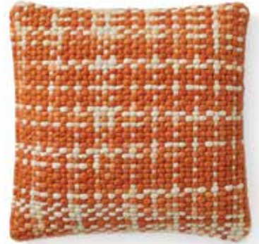
BLU DOT Bubbie pillow; $99. bludot.com