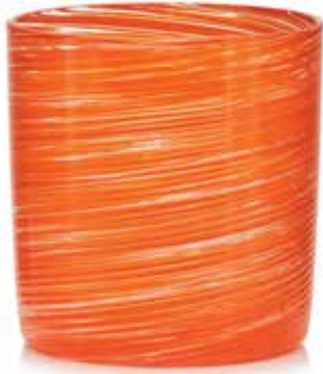
1 CRAFT ADVISORY Textured twist tumbler; $54. barneys.com