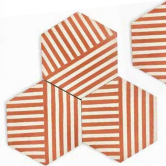
6 ERIN ADAMS DESIGNS Lee collection concrete tiles; $25 per square foot. erinadamsdesigns.com