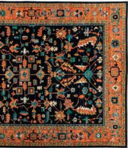
4 LILLIAN AUGUST Ziegler Collection area rug; $9,699. Norwalk, 203-847-3314; lillianaugust.com