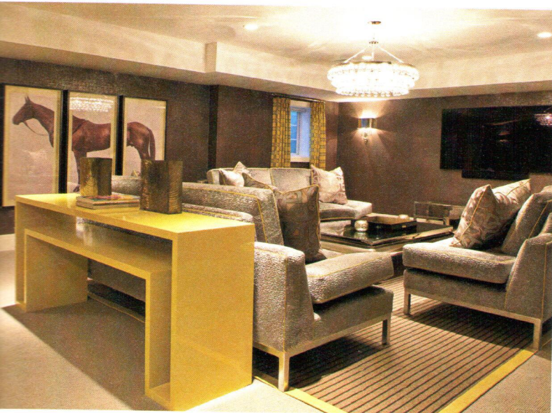
This amazing transformation of a basement into a cosmopolitan entertainment room features a trio of custom House of Clement sofas upholstered in a Parisian textured velvet.