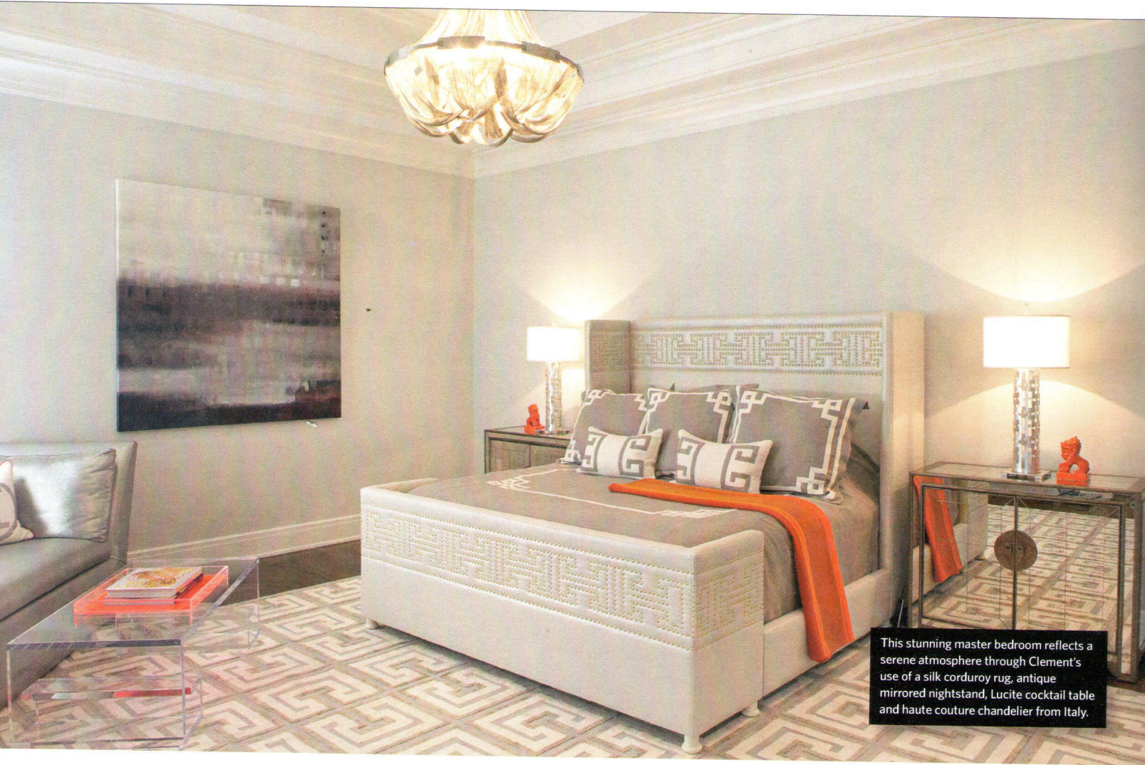
This stunning master bedroom reflects a serene atmosphere through Clement's use of a silk corduroy rug, antique mirrored nightstand, Lucite cocktail table and haute couture chandelier from Italy.

"Interior design is a medium for dressing a home with the same sex appeal, elegance and sophistication as art or fashion."