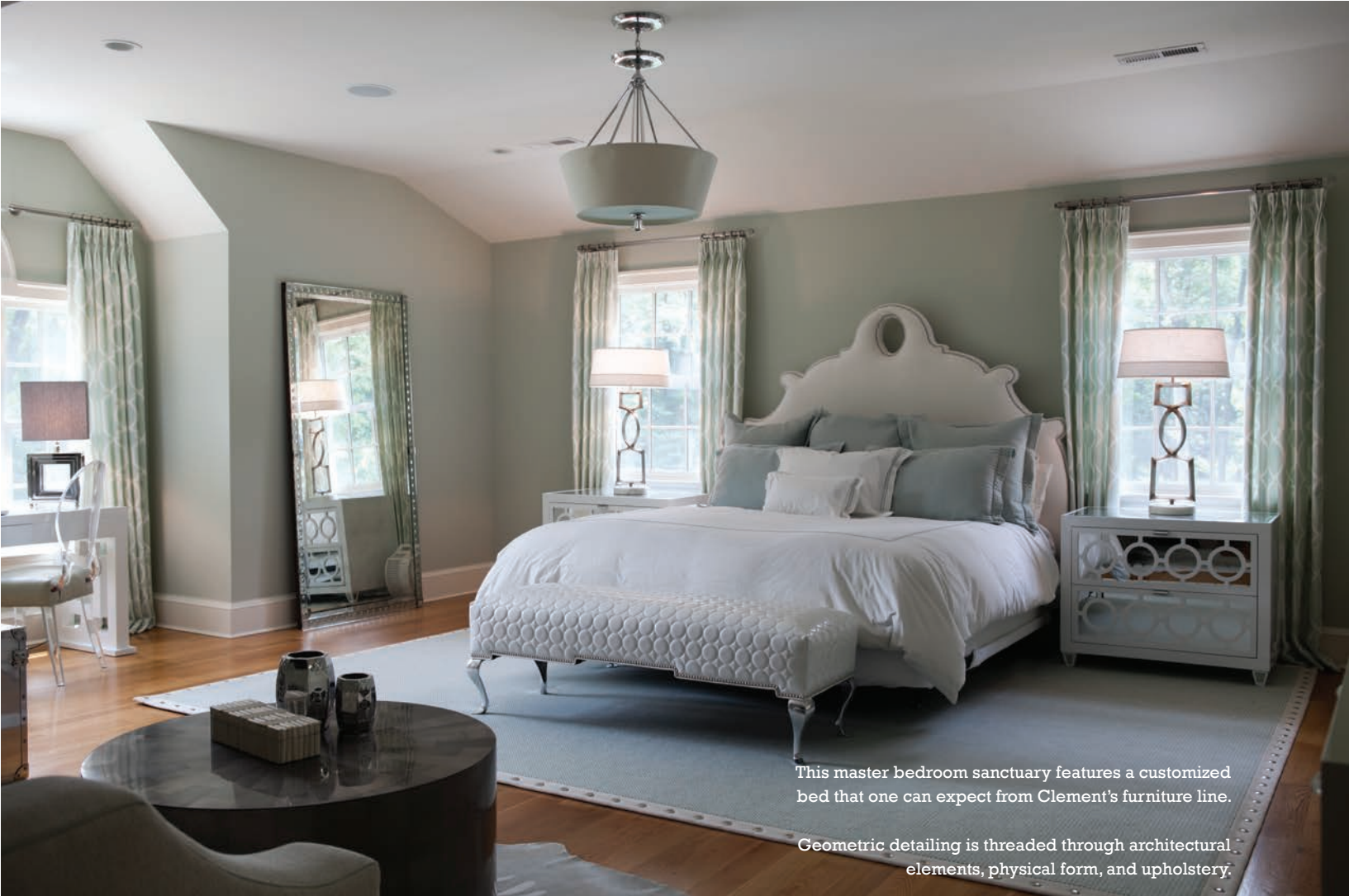
This master bedroom sanctuary features a customized bed that one can expect from Clement's furniture line.