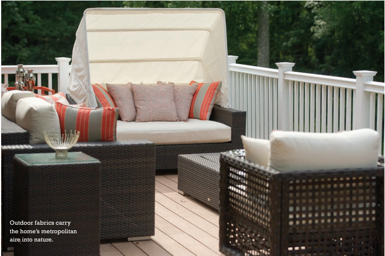
Outdoor fabrics carry the home's metropolitan aire into nature.

cated. “The detailing is all part of the common puzzle that defines the room: from the high gloss lacquer to the hand-hammered nail heads on the rug border- I could go on, but the truth is that the accomplishment resonates through all these details- which truly defines the identity of the room.”